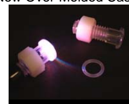
Accessory Lens, Nut & O-Ring