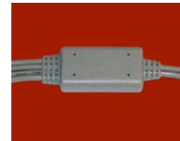
New Over-Molded Case