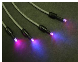
Color Changing LEDs