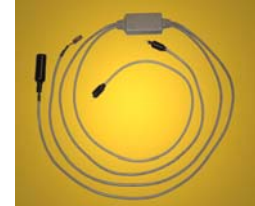
Dual-LED Cable Set