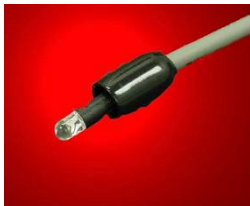
Bullet LED with Boot